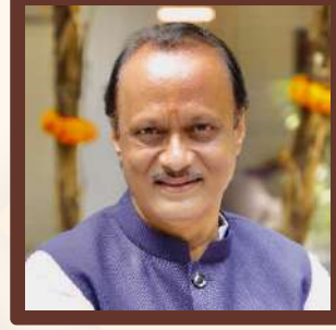
Shri. Ajit Pawar