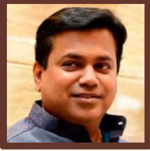
Shri. Uday Samant

Hon'ble Minister Higher & Technical Education