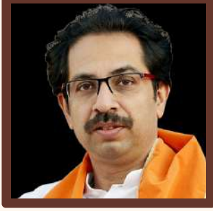
Shri. Uddhav Thackeray