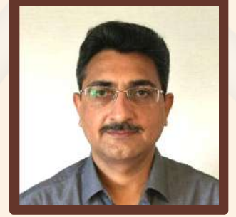
Shri. Rajiv Jalota (IAS)

Hon'ble Minister of State Higher & Technical Education