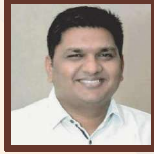
Shri. Prajakt Tanpure

Hon'ble Minister Higher & Technical Education