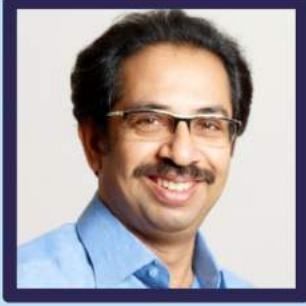
Shri. Uddhav Thackeray