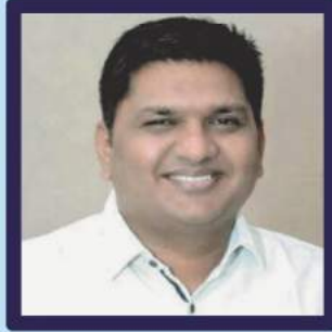
Shri. Prajakt Tanpure

Hon'ble Minister Higher & Technical Education