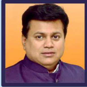
Shri. Uday Samant

Hon'ble Minister Higher & Technical Education