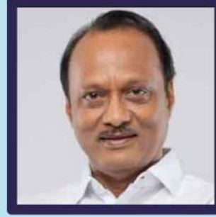
Shri. Ajit Pawar