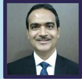
Shri. O. P. Gupta IAS

Hon'ble Minister of State Higher & Technical Education