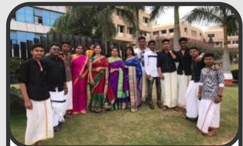
Traditional day Celebration