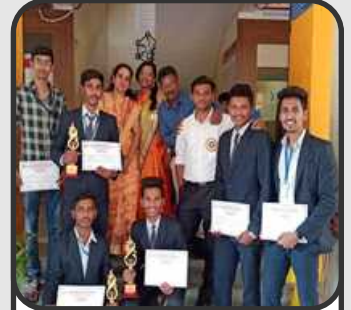
Won First Prize In Project Presentation