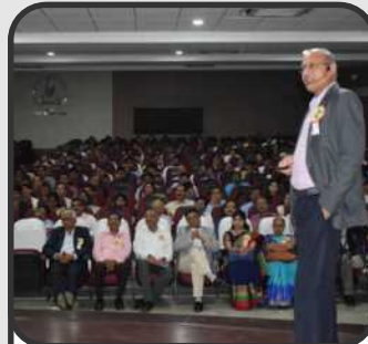
Maharashtra State Board Of Technical Education's Sensitization Workshop