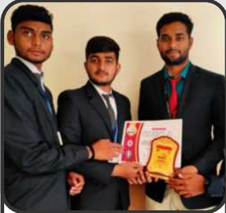
Awarded By Shodh Award Organized By Dipex 2020