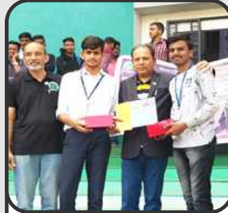
Awarded By First Prize In Paper Presentation Competition.