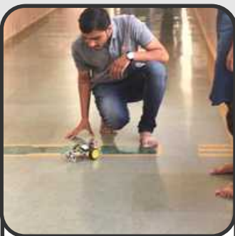
Workshop on Robotics

Glimpses of various activities like Workshop on Robotics, Technical Poster Presentation, Industrial visit, and Webinar on Robotics