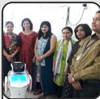
Visit to India First Robotics