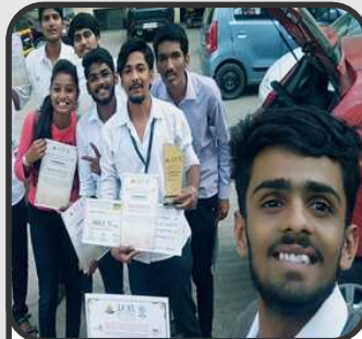
First Prize In Project Competition At Zeal Polytechnic, Narhe In "best Project With Optimum Cost Category"