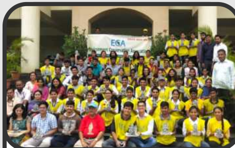
Eco-Friendly Ganapati Celebration