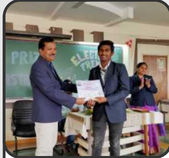
Winner of Paper Presentation Competition