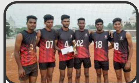
Volleyball Winner team