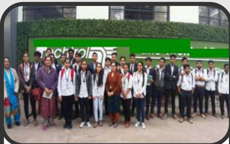
Industrial Visit to Techtrol Company