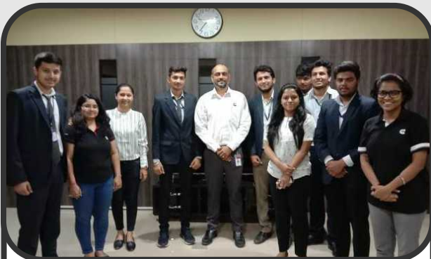
Glimpse of Placement Drive of Cummins India Ltd.