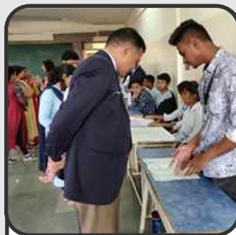
Technical Poster Presentation