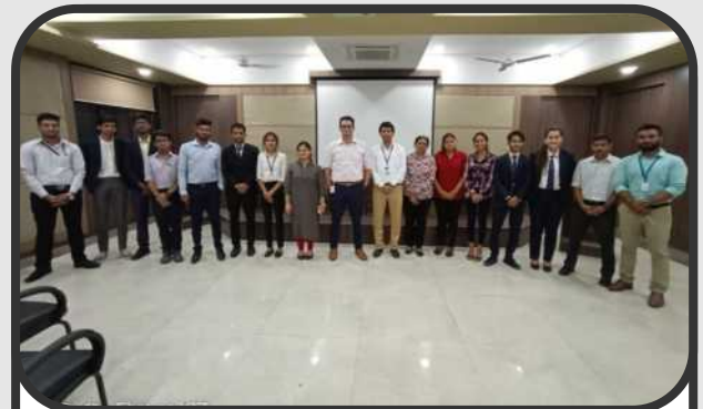
Pooled campus recruitment drive of Godrej and Boyce organized at Y B Patil Polytechnic on 17th Feb 2020