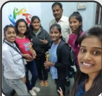
Girls Team Won Third Prize In Moraya Festival For Kabbadi Sports.