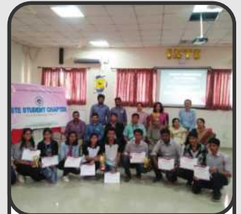
Won Second Prize In The Event Of Project Competition Department Held Under Iste Student Chapter