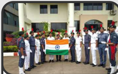
Republic Day Celebration